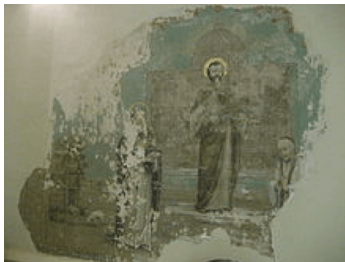
Right to left: Pope Pius IX, Christ, and Thomas Aquinas